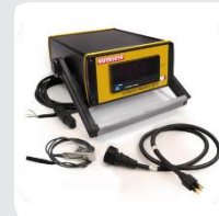
H29P Surface Display Pro' 6004-0079