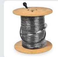
H35 BathyCorrometer to SDU Umbilical 50m 6004-0038