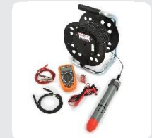
H50 Marine Survey Kit 60004-0044