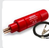
H3P CalChecker Pro' 6004-0080