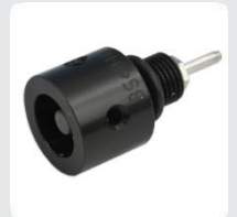
H6 Silver/Silver Chloride Half Cell 6004-0051