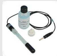
H124 Glass K-Series Reference Cell 6004-0013