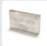
H9 Magnesium Test Blocks 6004-0053