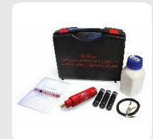
H28 BCM Verification Kit 6004-0031