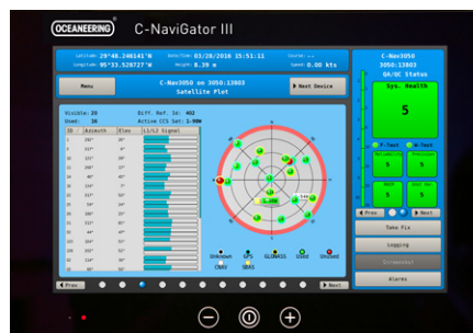
Control Display Unit