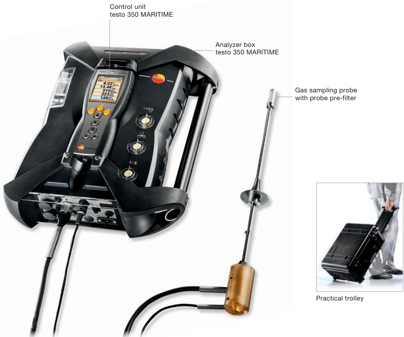
Control unit testo 350 MARITIME

In addition to this, NOx measurement in special regional zones is also possible with the testo 350 MARITIME, for example for reducing the NOx tax in Norway.